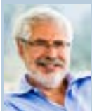
Steve Blank Entrepreneur, Author, Berkeley & Stanford Faculty